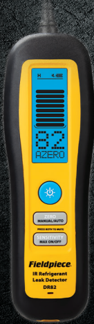
Leak Detectors DR82, DR58