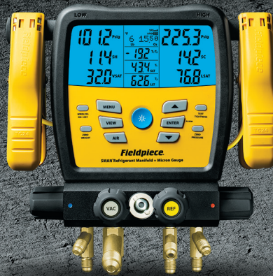
Refrigerant Manifolds SM480V, SM380V