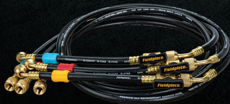
Recovery Hoses and Extensions HR3, HR3B, HR3L, HR3XB, HR3X, HR1XR