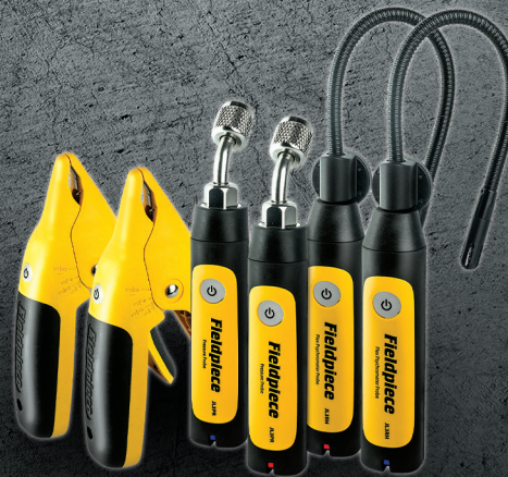
Charge and Air Kit Probes JL3KH6, JL3KR4, JL3PC, JL3PR, JL3RH