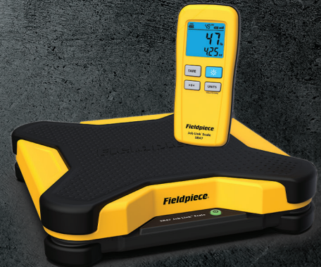
Refrigerant Scale SR47