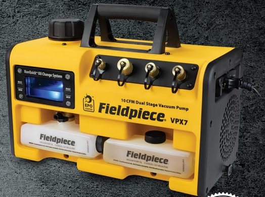
Vacuum Pumps VPX7, VP87, VP67