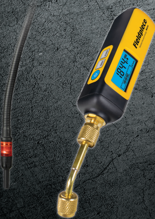
Vacuum Gauge MG44