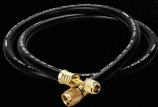
Vacuum Hoses HV1, HV1S