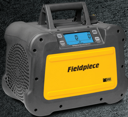
Recovery Machine MR45